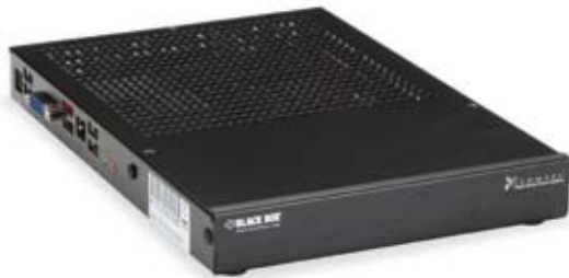
Front view: iCOMPEL

Set up vibrant, real-time displays with this easy-to-use digital signage platform!